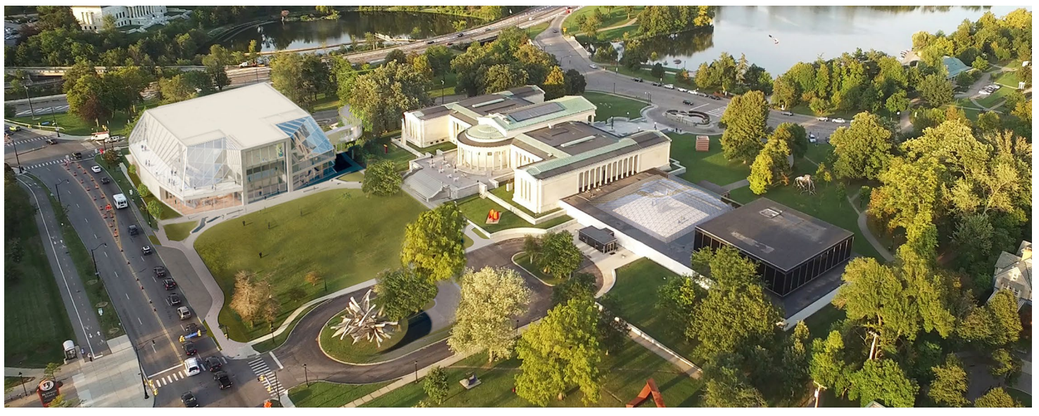
Top: Albright Knox campus prior to redevelopment; Bottom: AKG campus rendering