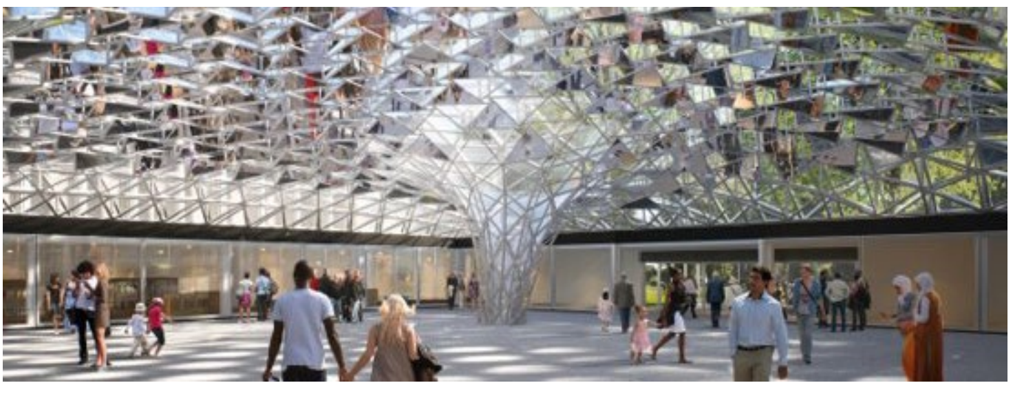
Top: new 30,000 sq. Foot gallery rendering; Bottom: Olafur Eliasson's Common Sky sculptural roof installation