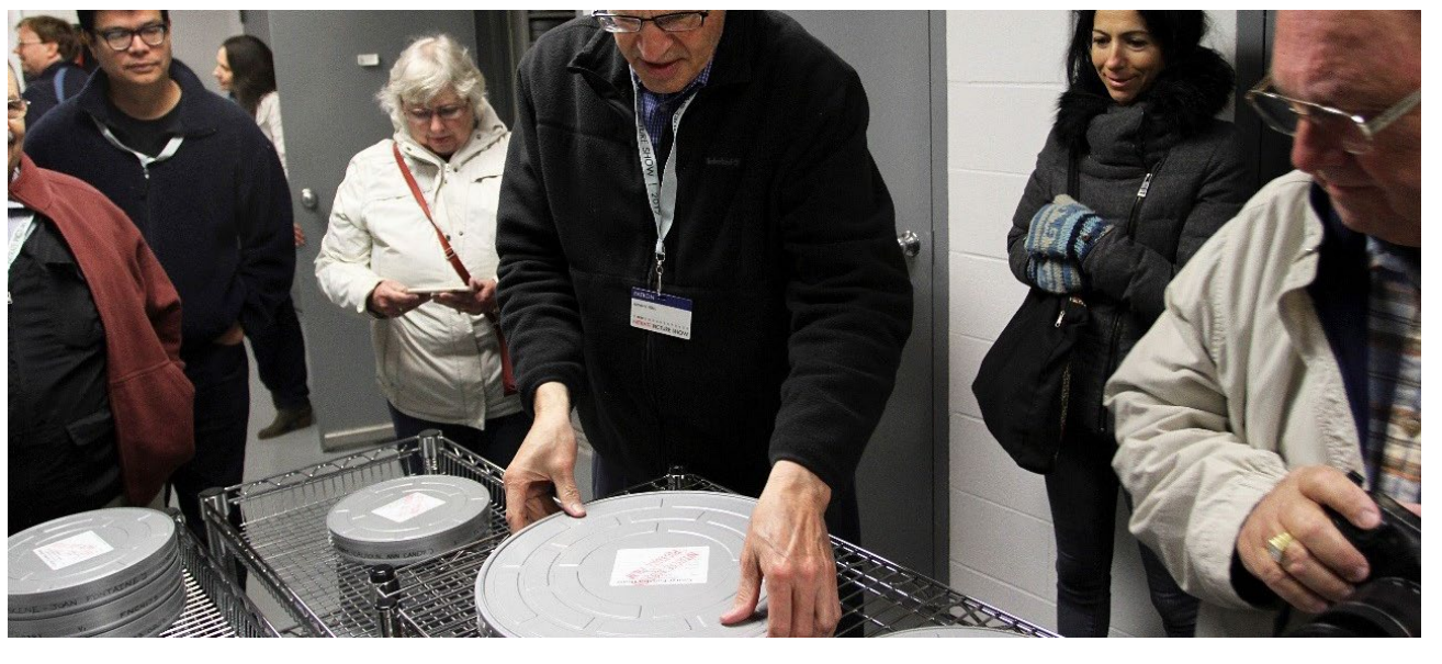
Top: Louis B. Mayer Conservation Center Bottom: Conservation Center group tour