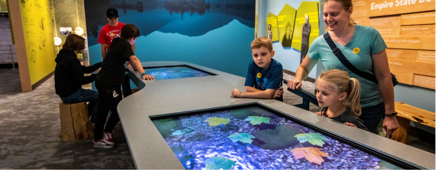
Top: Installation of new HVAC system; Bottom: visitors exploring ADX gallery