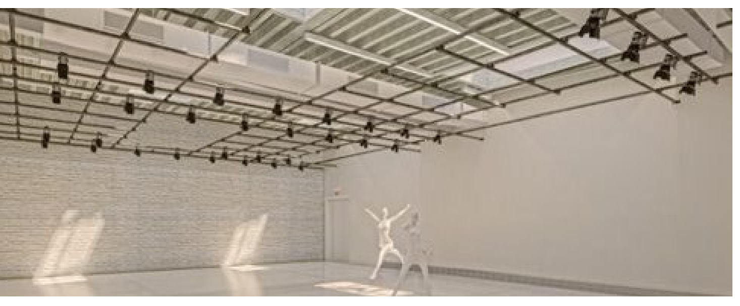
Top: Project in development in new space prior to construction. Bottom: rendering of new studio/performance space