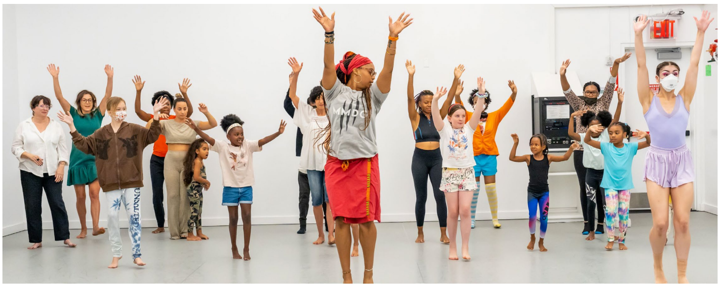
Top: completed dance studio Bottom: Mark Morris open house African dance class