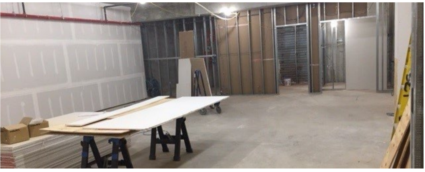
Top: in progress construction connecting new space to existing dance center; Bottom: in-progress studio construction.