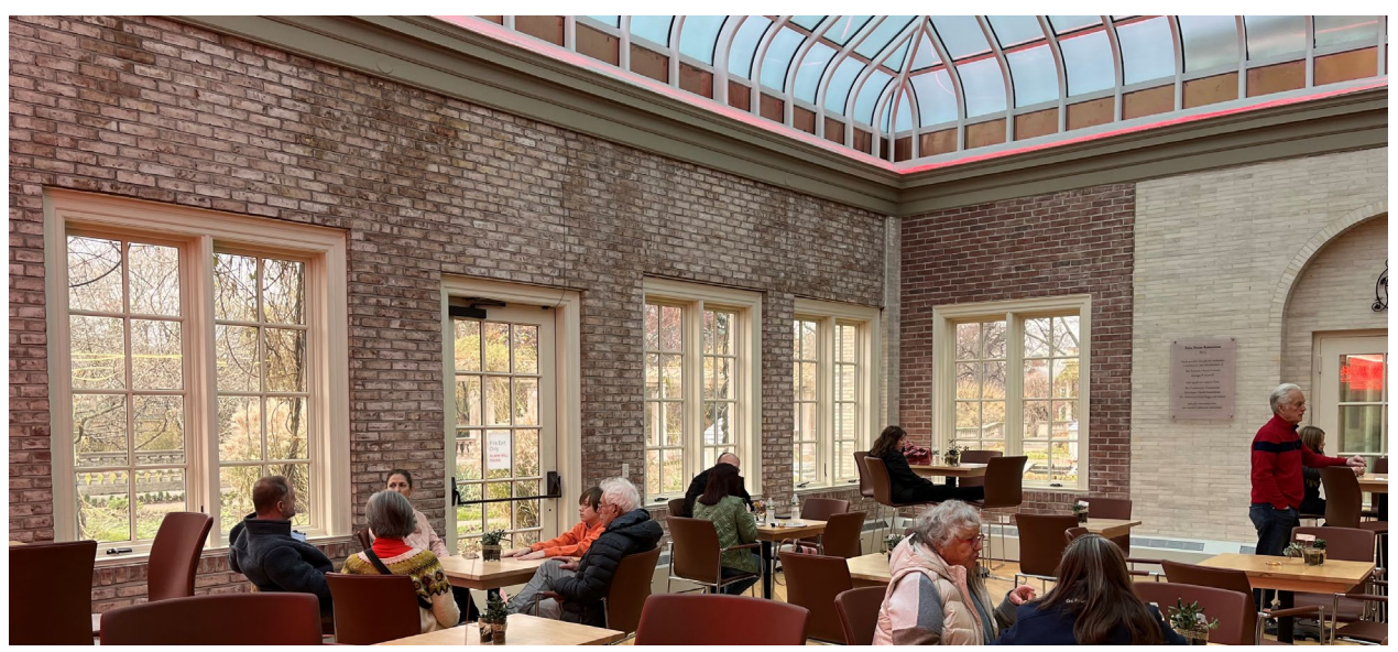
Top: former Eastman Café Bottom: new Tischer Center café