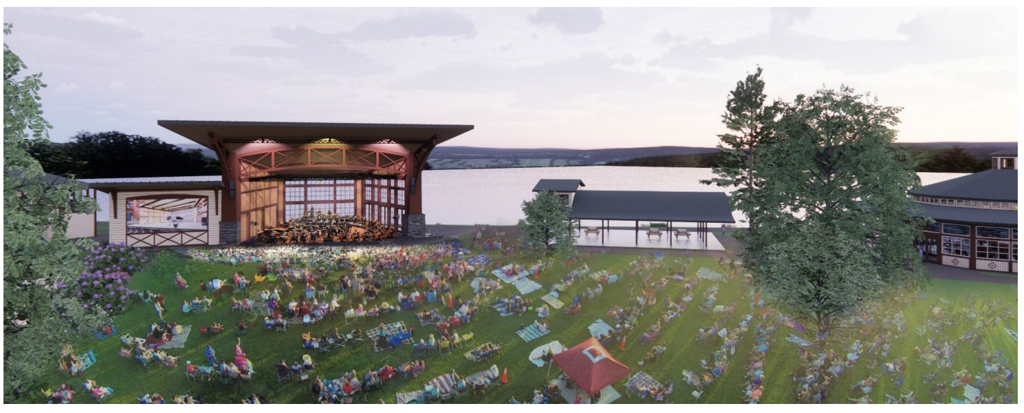
Top: view of new amphitheater from the lake. Bottom: arial view of amphitheater rendering.