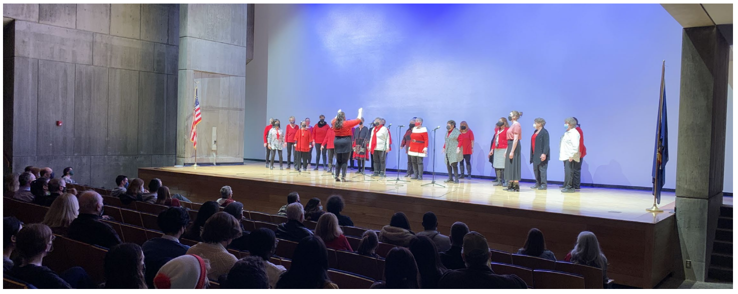
Top: auditorium and stage prior to renovation Bottom: auditorium and stage after renovation