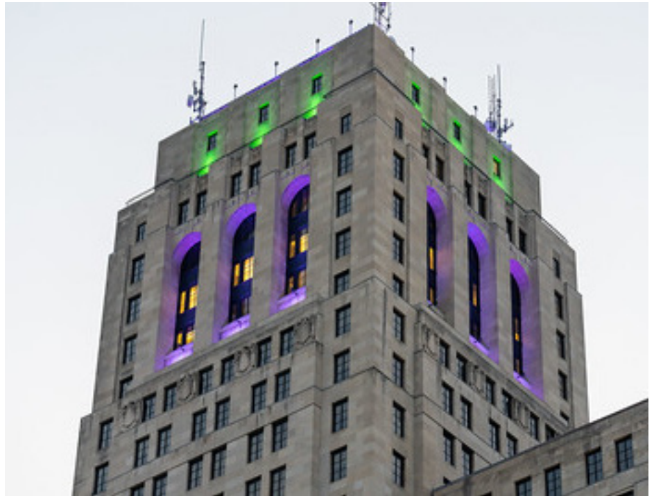
State landmarks illuminated to raise awareness for suicide prevention month

Expand Residential Programs. Governor Hochul is investing $890 million in capital to build 2,150 new residential beds for people with mental illness who need varying levels of supports. This includes 500 new Community Residence – Single Room Occupancy (CR-SRO) beds, 900 Transitional Step-Down Beds, and 750 permanent Supportive Housing beds. The Governor's plan also calls for 600 licensed Apartment Treatment beds and 750 scattered site Supportive Housing beds, for a total of 3,500 new units throughout the State. In addition, the Budget also provides $25 million in capital resources to develop 60 community step-down units designed to serve formerly unhoused individuals who are transitioning from inpatient care.