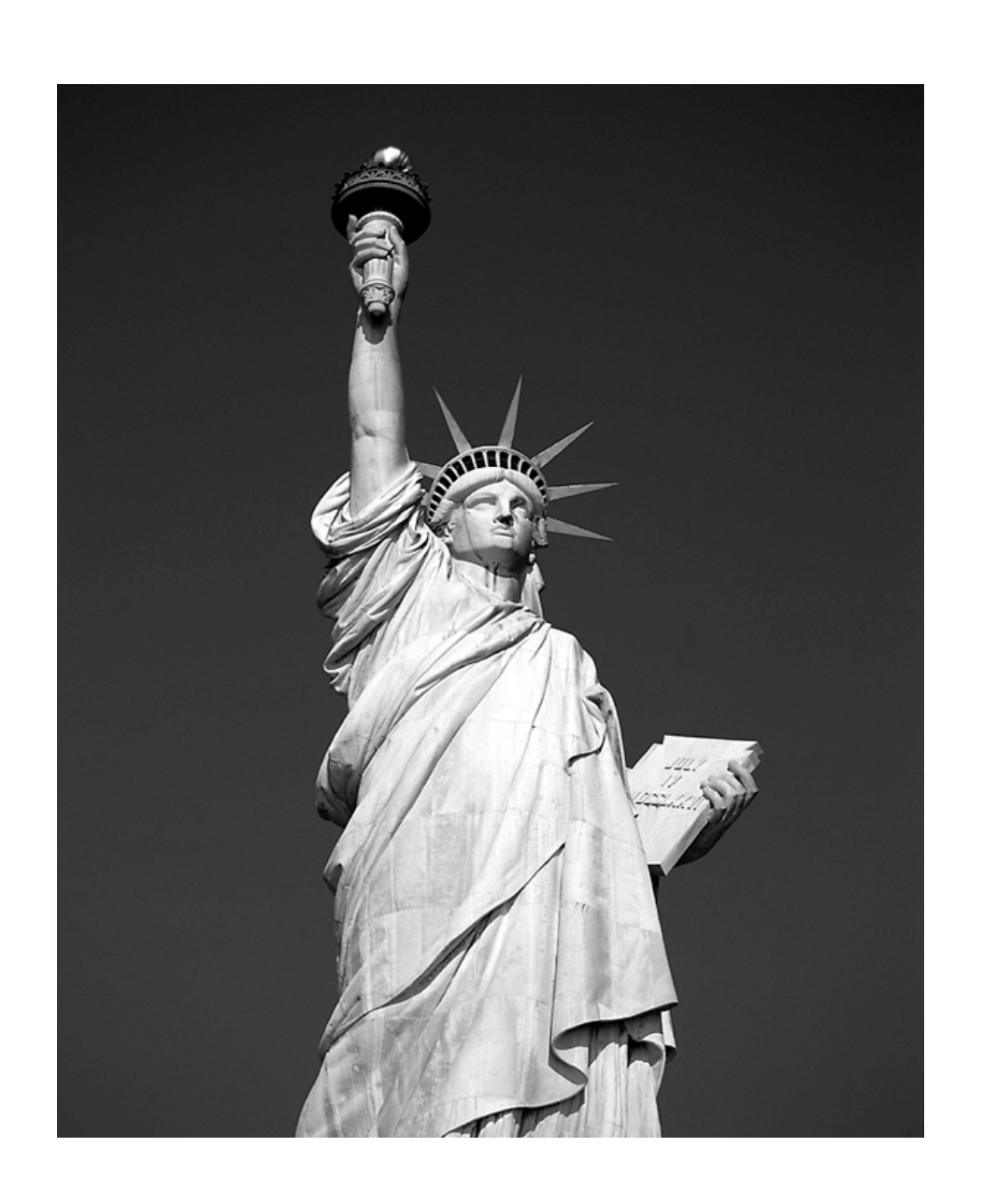
New York State